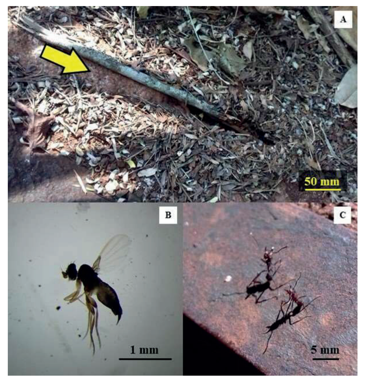
Figure 1. Foraging trail of a nest of Acromyrmex crassispinus (A); Leafcutter parasitoid phorid ( Myrmosicarius catharinensis ) (B); Behavioral reaction of Acromyrmex crassispinus workers attacked by Myrmosicarius sp. (C). Horizontal lines indicate the scale in millimeters.