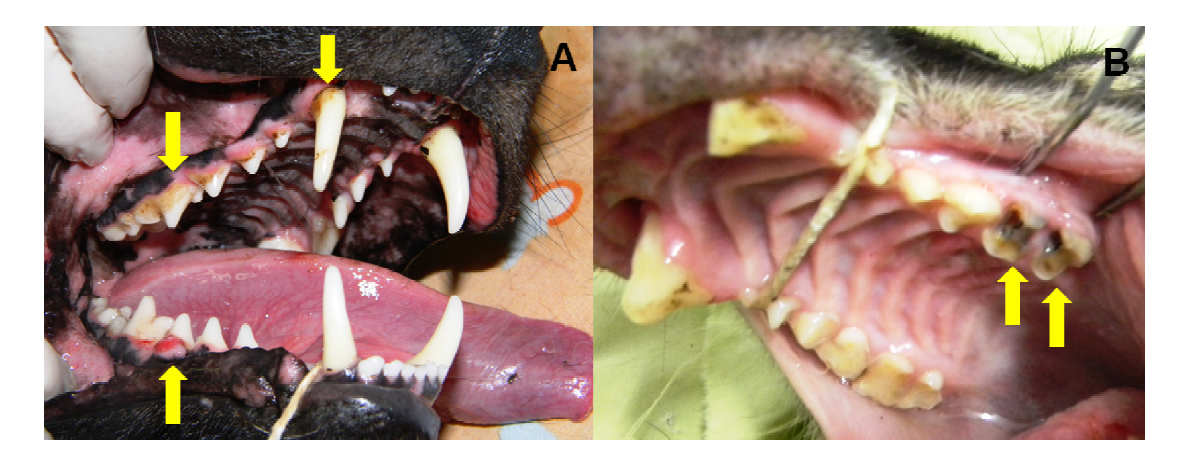
Figure 1. A. Grade I dental calculus and gum hyperplasia corresponding to the 4th premolar lower right in the maned wolf. B. Grade II wear and presence of caries in the 1st and 2nd upper left molar in the coati.