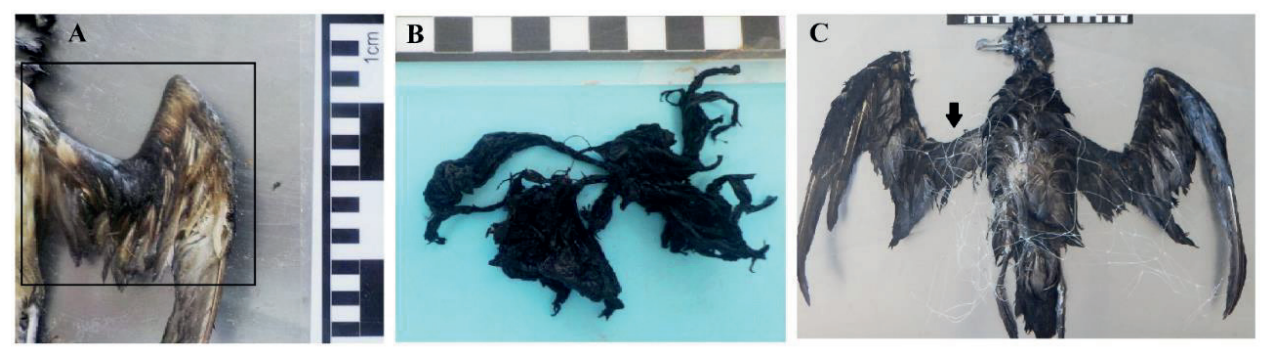
Source: Beach Monitoring Project - Santos Basin, Universidade Federal do Paraná, Pontal do Paraná, Paraná, Brazil. Figure 1. Macroscopic findings of anthropogenic interaction in stranded seabirds off the coast of the Paraná State. (A) Puffinus puffinus presenting blackish spot on left wing (demarcated area), suggestive of contact with oil. (B) Plastic residue found in the stomach of Procellaria aequinoctialis . (C) Procellaria aequinoctialis showing interaction with fishing net (arrow).

The importance of research on stranded birds should be emphasized to understand the effects of not only acute (during major spill accidents) but also chronic exposure caused by the sum of operational discharges, constant and small leaks, and/or spills during offshore drilling or transport operations (Camphuysen & van Franeker, 1992).