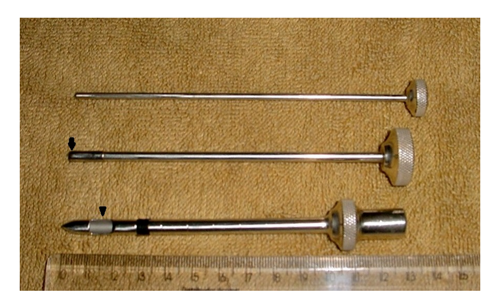
Figure 1 . Three components of the G6 Bergström percutaneous biopsy needle. A hollow puncture cylinder with a sharp edge, used for muscle fiber divulsion, and a compartment for sample storage (arrow head); another hollow cylinder that slides inside the needle, with a sharp edge (arrow), and a stylet used for extracting the sample from the needle's interior.

Muscle fragments were extracted and wrapped in aluminum foil, which has cryoprotective functions, thereby avoiding damage during freezing. The samples were then immediately frozen using liquid nitrogen at -160^{\circ} C by direct immersion until "bubbling" ceased; samples were then stored in an appropriate canister until processing. Transverse 10-µm histological sections were made, as per the method of Dubowitz et al. (2013a), using a cryostat at -20^{\circ} C, and samples were collected with glass slides.